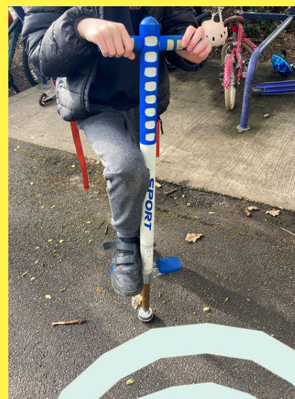
Sparking skateboards, pogo sticks, Bike & Scooter Dr's and Bling Your Rides